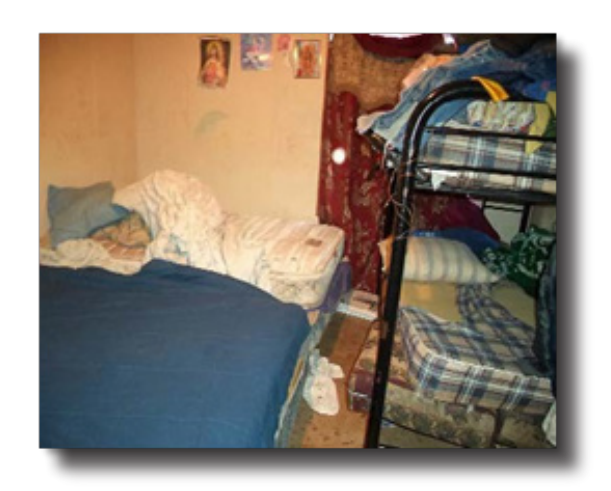
Workers' housing on Anderton's property