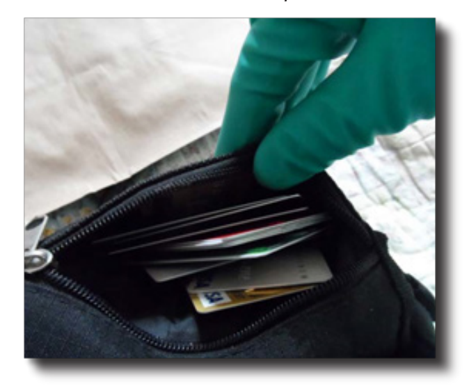
Case with debit/credit cards

The investigation uncovered several items including Termine's notepad, debit and credit cards issued in the names of individuals who did not reside at Termine's residence, and several blank plastic cards with magnetic stripes that are used to make debit and credit cards. Termine also